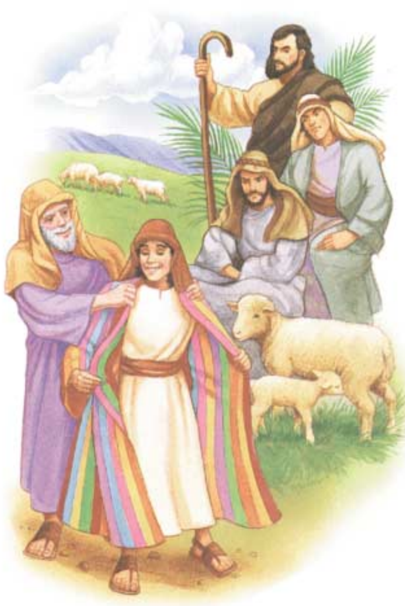
Joseph's robe of many colors Genesis 37:1-36